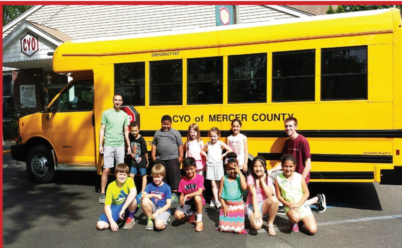
CYO students and staff pose for a picture in front of the new 2015, 29 passenger school bus. Thank you to the major bus donors that made this purchase possible: James Kerney Foundation, Mercer Fund of the Community Fund of NJ, and Mary Owen Borden Foundation. In addition, we appreciate the numerous individuals and organizations who supported this fund-raising effort!